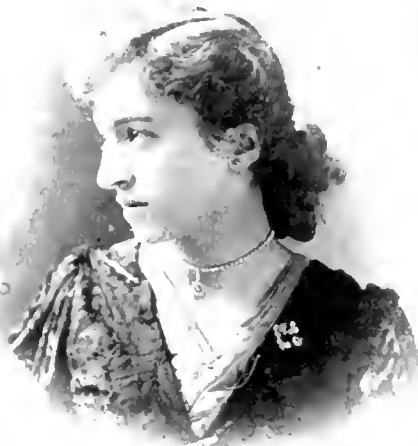
FANNIE BLOOMFIELD ZEISLER.